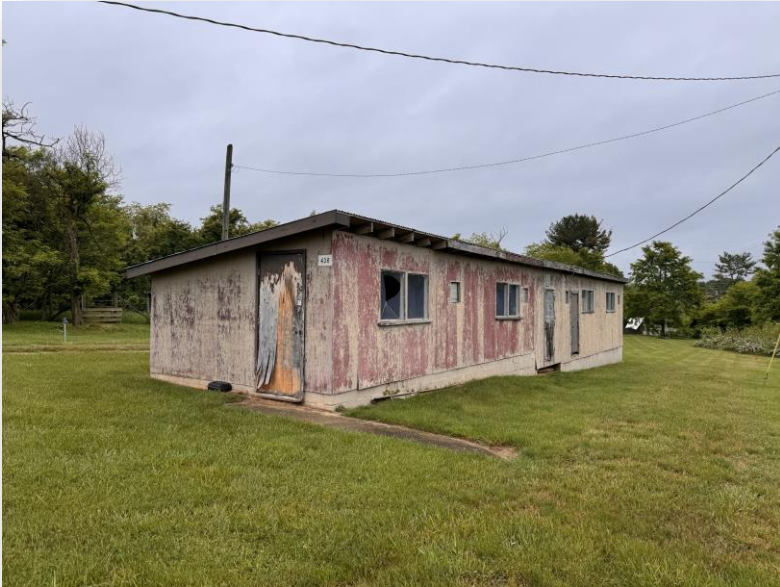
VIEW TO THE NORTHWEST