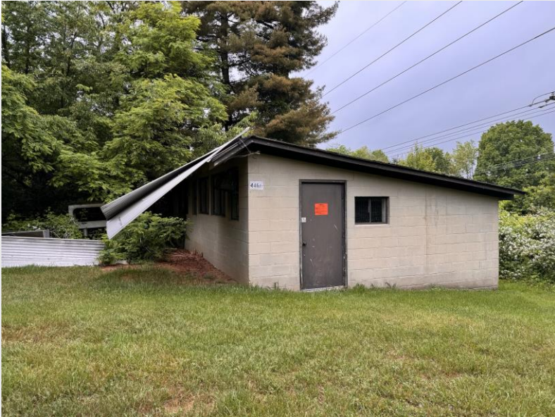
VIEW TO THE WEST