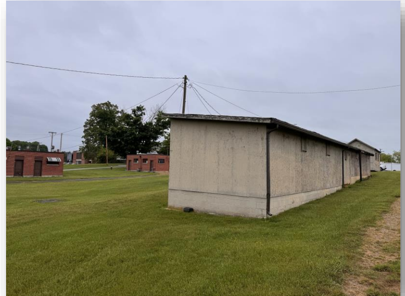
VIEW TO THE SOUTHEAST