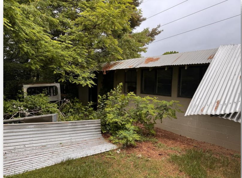
VIEW TO THE NORTHEAST